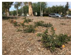
The Lantana 'Radiation' taking shape under the Windrow.