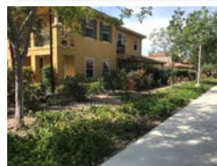
Recently approved area renovations begin in March along Towngate.